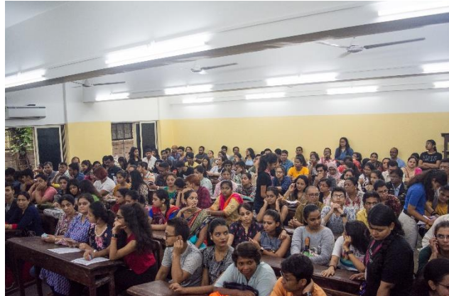
First Year students attending the orientation programme