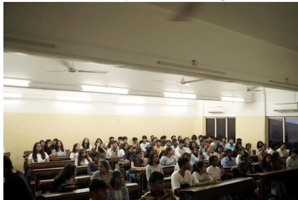
First Year students attending the orientation programme